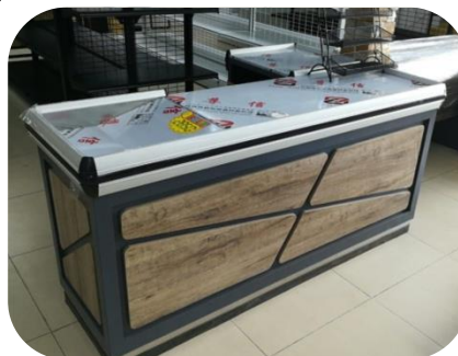
Wooden Cashier Counter