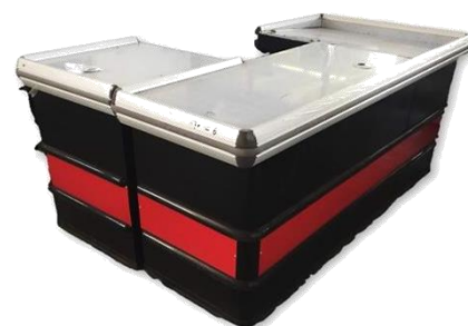
Luxury Cashier Counter